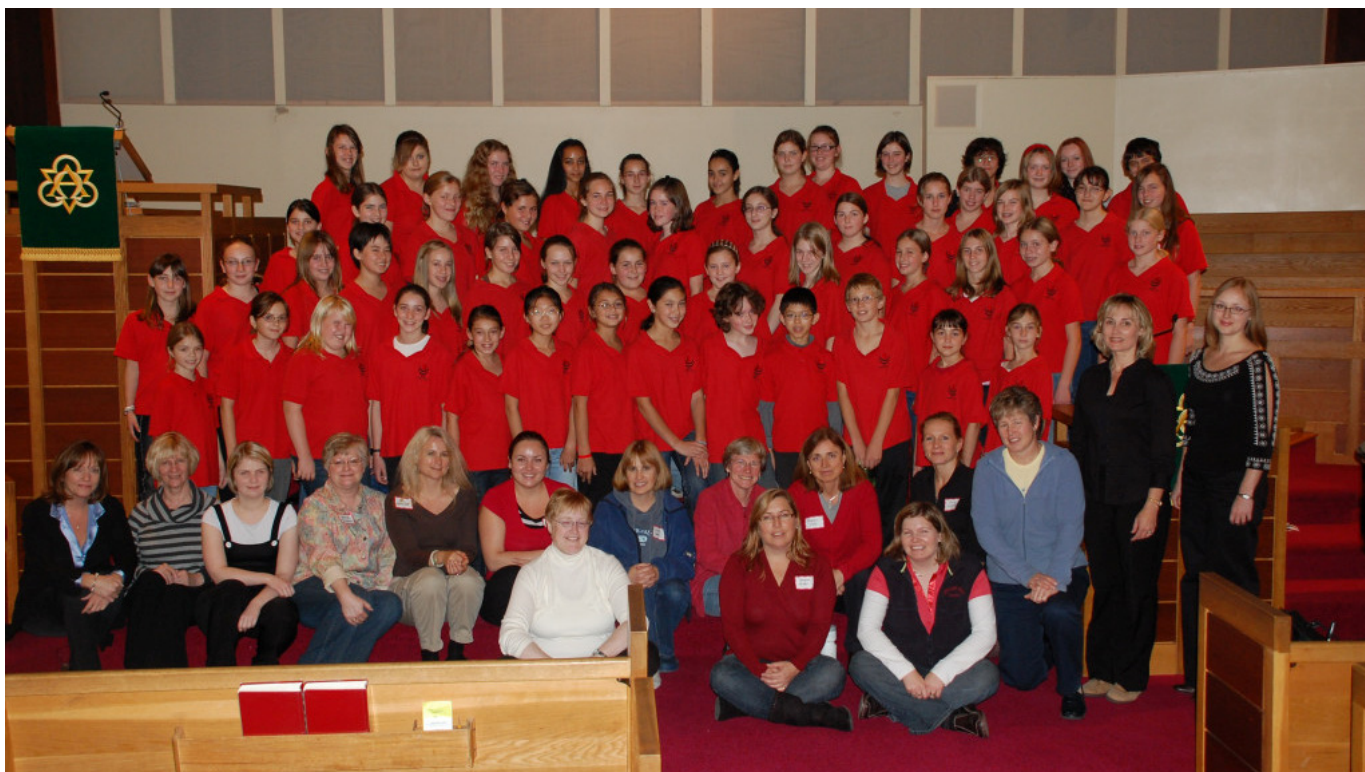
Chamber and Senior Concert Choir members at the Education Outreach Program - Choral Technique Workshop