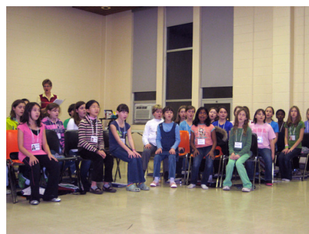
Concert Choir prepares for their upcoming performance